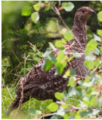
Female Dusky Grouse