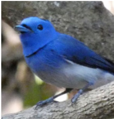
Black-naped Monarch by Christopher Rustay

Thailand is fast becoming one of the go-to places for birders. With a country list of around 1,000 birds and with a well-developed infrastructure, Thailand can provide a rewarding birding visit. On top of all that, Thailand has unparalleled food and culture. So if you are looking to enjoy southeast Asian food and drink, wander among temples, climb mountains and visit beaches and see loads of birds, Thailand may just be the place. Christopher Rustay will talk about his recent Thailand birding trip and show off some of this delightful country.