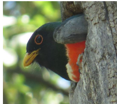
Elegant Trogon

One major highlight of camp [was] a pair of Common Black Hawks at Rose Canyon Lake [but] the heart of the camp [was] the Chiricahua Mountains. . .