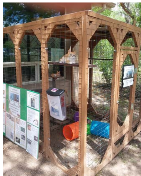
The CNMAS "catio" cat enclosure on permanent display at New Mexico Wildlife Rescue.