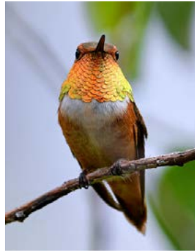
Rufous Hummingbird

Enjoy a weekend getaway to the Gila National Forest and join in this local hummingbird celebration. The event is free and runs from 8:00 a.m. to 3:00 p.m. each day at the Mimbres Culture Heritage Site, 35 minutes east of Silver City. There will be vendors, lectures, education, children's activities, a raffle ice cream sale and archaeological tours led by the Heritage Site's museum staff. And hummingbirds, of course! Rivoli's, Calliope, Rufous, Broad-tailed and Black-chinned are all possible here. If you're feeling adventurous, the Gila Cliff Dwellings are in the neighborhood, as well as several birding hotspots, like Lake Roberts and Cherry Creek Campground. For more information about the festival call 575-536-3333 or copy and paste this link into your browser: http://www.silvercity.org/events/details/hummingbird-festival-4839 .