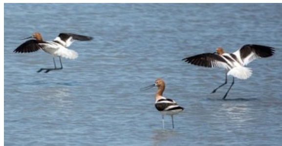
Vermilion Flycatcher at Rattlesnake Springs and American Avocets at Bitterlake NWR

Read more about the birdathon and see many more pictures on Judy Liddell's blog, https://wingandsong.wordpress.com/2018/05/07/24-hour-birdathon-raising-funds-for-audubon/