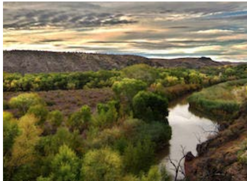
Gila River Box by Jason Branch

The National Audubon Society's 2016–2020 Strategic Plan identified water as a core priority and focused on landscapes where water scarcity and water quality are primary limiting factors for the survival of threatened and iconic birds in the Western Hemisphere. The water strategy engages Audubon's conservation, policy, and science teams and the Audubon network to influence water management decisions in order to balance the needs of birds and people living on or near habitats dependent on fresh water across the nation. Although Audubon has been a bird conservation leader in the West for decades, a more comprehensive scientific look into western water has been needed—in one place, and with an eye toward birds — to help guide our strategy moving forward.