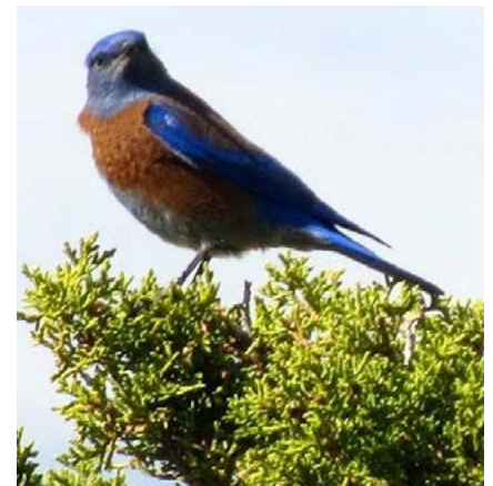
Western Bluebird at Elena Gallegos Open Space in January.

In January, 27 individuals conducted bluebird surveys on 16 routes along the Rio Grande, in the Sandia foothills, in the East Mountains and almost to Tajiique in the Manzano Mountains. Each survey consisted of twelve five-minute point counts. This is the third survey CNMAS members have participated in, along with teams from chapters across the country, to document species at risk due to climate change.